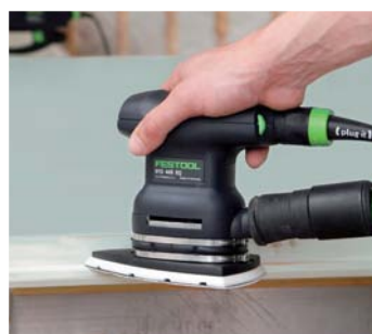
DTS 400 EQ