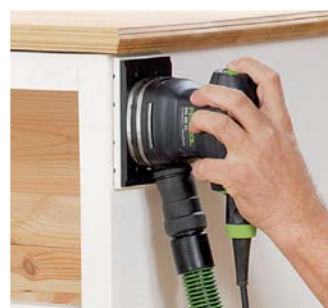
RTS 400 EQ

Compact and light, Festool finishing sanders are ergonomically superior and easily operated with just one hand. These sanders feature an encapsulated bearing unit and an integrated dust extraction port, resulting in a better finish, improved air quality and a long service life. Festool finish sanders make every aspect of the job faster, better, and easier from start to finish.