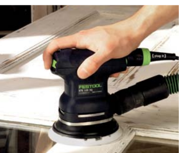
ETS 125 EQ