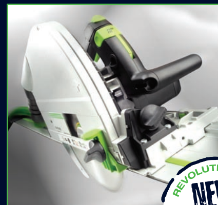
TS 75 EQ plunge-cut saw

Cut through your workload like never before with Festool's new TS 75 plunge-cut saw. Take on bigger projects with our largest cutting depth yet – 2 15/16" or 2 3/4" with the included guide rail. And with 13 amps of adjustable power, the TS 75 has plenty of muscle to spare and so will you, since it weighs less than 14 pounds. A limit stop and slip clutch drastically reduce the effects of kickbacks, making the TS 75 much safer to use. The splinter guard and guide rail make glue-ready cuts a reality. Add it all up and you have a fierce, versatile saw that's easy on the user and tough on everything else. To learn more about the TS 75 and the entire Festool system, contact us or visit your local Festool dealer today.