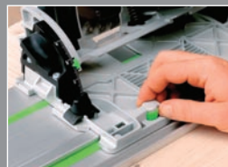
Tool-less adjustment for zero play on the guide rail