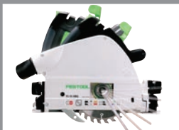
FastFix saw blade changing system