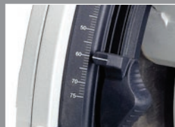
Precise depth adjustment to the millimeter