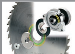
Slip clutch protects gears and helps prevent kickbacks