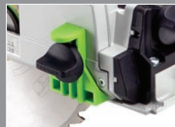
Splinter guard for clean cuts on both sides of blade