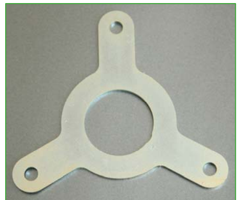
Guide Bushing Adapter for OF 2000