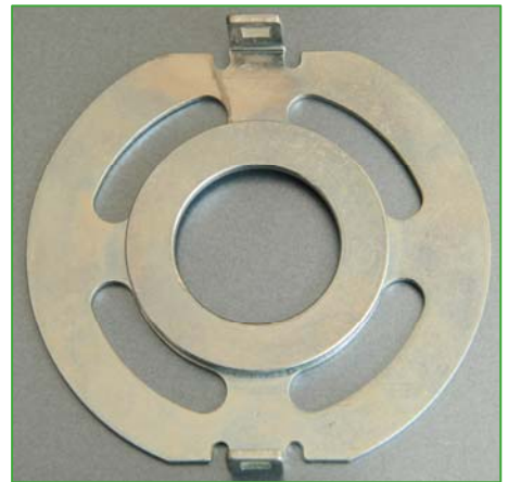
Guide Bushing Adapter for OF 1400