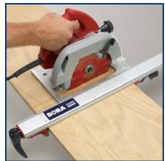
Circular Saw Guide